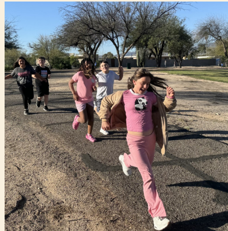
WALK AROUND WEDNESDAY